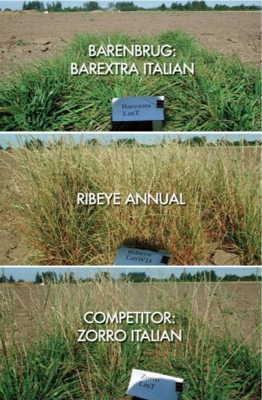
Spring planted "grow-outs." Ribeye is annual so seed heads should be expected. Both BarExtra and Zorro are Italian ryegrasses. However, Zorro, a competitor's variety, has annual contamination.

Barenbrug has the strictest guidelines for the genetic purity of Italian ryegrass. Many steps are taken to insure that our Green Spirit Italian ryegrass is not contaminated with annual ryegrass. Barenbrug pays a premium to find growers who have clean fields, free of annual ryegrass contamination. Additionally, our research department conducts multiple "grow-outs" to determine the genetic purity of various fields. A grow-out is a planting of seeds to test certain characteristics. Though this process is laborious and expensive, it insures that when you see the Barenbrug yellow bag you can trust that you are buying the best quality seed on the market.