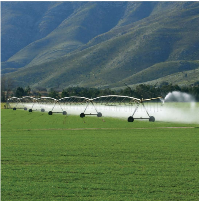
Green Spirit produces impressive forage yields of exceptional high quality feed.

The varieties used in Green Spirit require prolonged periods of cold weather for vernalization. Once vernalized the plant has the ability to produce seed heads which result in the loss of forage quality. Inferior products that imitate Green Spirit vernalize with much shorter periods of cold, producing seed heads soon after planting when spring night time temperatures drop.