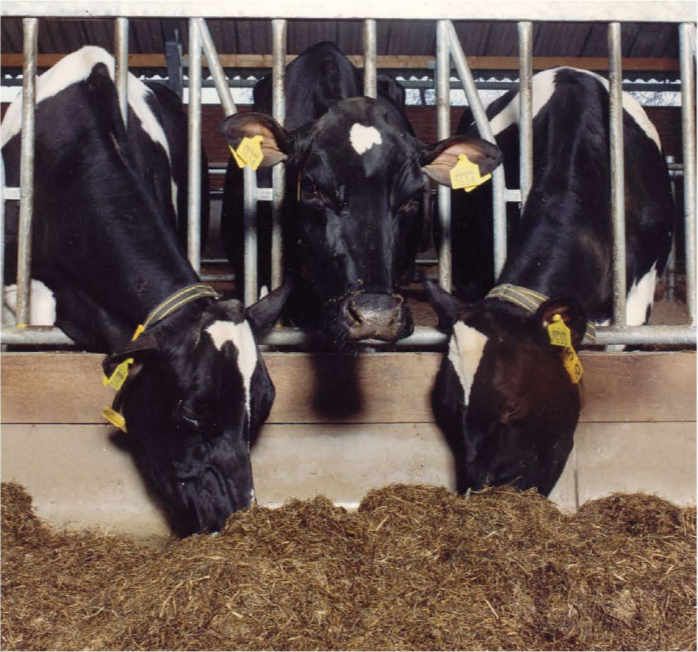
Green Spirit is ideal as silage or green chop for high producing dairy cows.

The yield results are displayed in Table 1 and 2. Green Spirit not only significantly out yields both alfalfa and soybeans, but it even comes close to yielding the same as corn silage. But what does it do to the rotation? In the study, every crop was rotated out and followed by corn silage. As you would expect, the worst corn silage yields were on ground that was planted to corn silage the previous year. But here is the surprising result: The highest yields of corn silage were on ground that was planted to Green Spirit the previous year. There was no yield