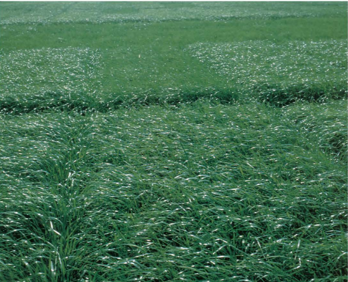
Barenbrug has the strictest guidelines for genetic purity of Italian ryegrass.

Establishment: Green Spirit may be planted in the fall or spring. We recommend drilling Green Spirit for best results. Prior to planting, apply 100lbs of a 20:20:20 fertilizer. For fall planting, plant immediately after harvest to improve establishment and graze or cut prior to winter in order to thicken the stand and promote winter survival. For spring planting, plant early in the spring. Green Spirit may be planted via full-cultivation, no-till drill or broadcast seeding. When planting as a nurse crop for a perennial or interplanting into an existing alfalfa stand,