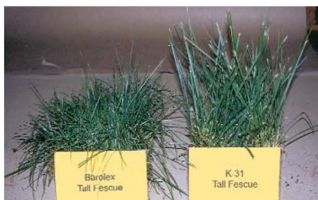
The clear difference between a soft-leaved tall fescue (Barolex, left) compared to Kentucky-31 (right).

Tall fescue is a widely adapted cool season grass. In the transition zone, tall fescue is used extensively due to its superior summer production. Now there is a new generation of tall fescue available. They are soft-leaved tall fescues. The picture below clearly shows the difference between a soft-leaved tall fescue and Kentucky-31. The Kentucky-31 leaves are wide, open, rough and upright. The Barolex is fine-leaved, soft and very dense. This picture was taken 5 months after planting side by side.